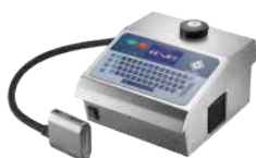
Large Character Inkjet Printer