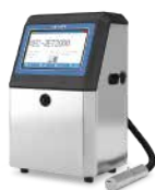
Continuous Inkjet Printer

*Please consult EC-JET for more information