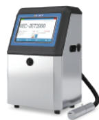
Continuous Inkjet Printer

*Please consult EC-JET for more information