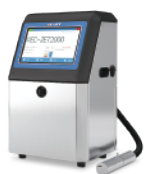
Continuous Inkjet Printer

*Please consult EC-JET for more information