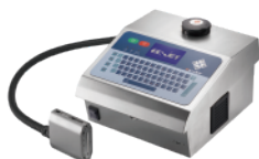
Large Character Inkjet Printer