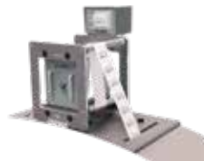
Thermal Transfer Over-printing Printer