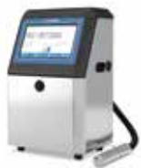
Continuous Inkjet Printer

* Marking speed and linear speed are substrate and code dependent