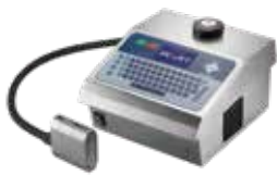
Large Character Inkjet Printer