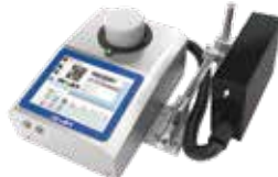
High resolution Inkjet Printer