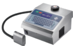
Large Character Ink-jet Printer