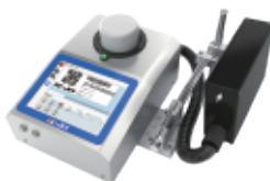
High-resolution Inkjet Printer