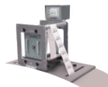
Thermal Transfer Over-printing Printer