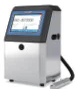
Continuous Ink-Jet Printer

* Marking speed and linear speed are substrate and code dependent